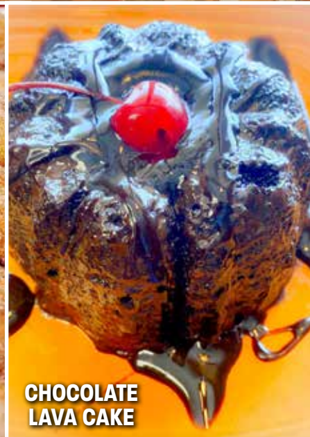
CHOCOLATE LAVA CAKE