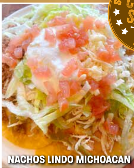
NACHOS LINDO MICHOACAN