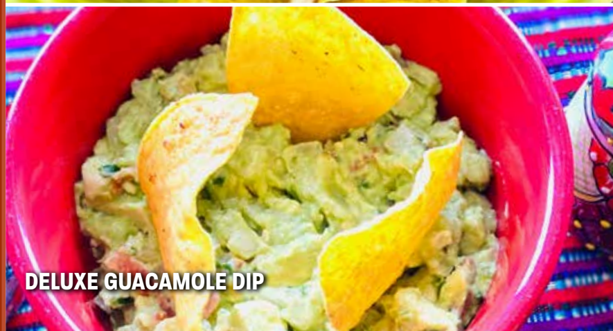
DELUXE GUACAMOLE DIP