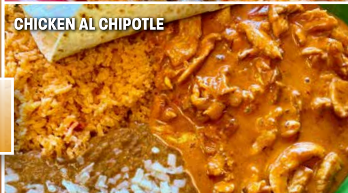
CHICKEN AL CHIPOTLE

*Consuming raw or undercooked meats, poultry, seafood, shellfish or eggs may increase your risk of foodborne illness, especially if you have a medical condition.