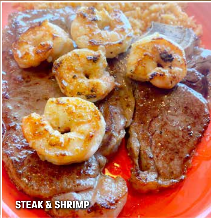
STEAK & SHRIMP