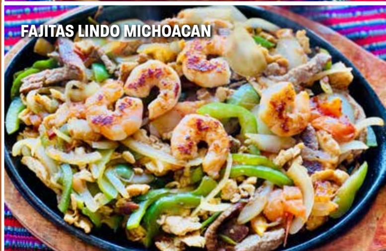
FAJITAS LINDO MICHOACAN