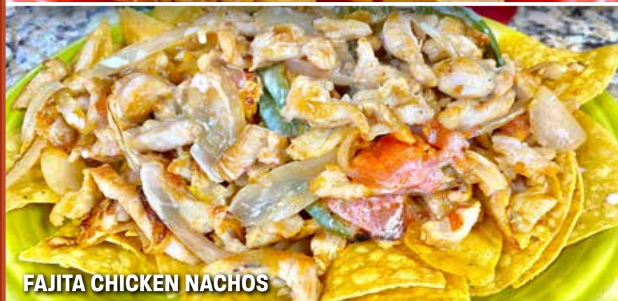
FAJITA CHICKEN NACHOS