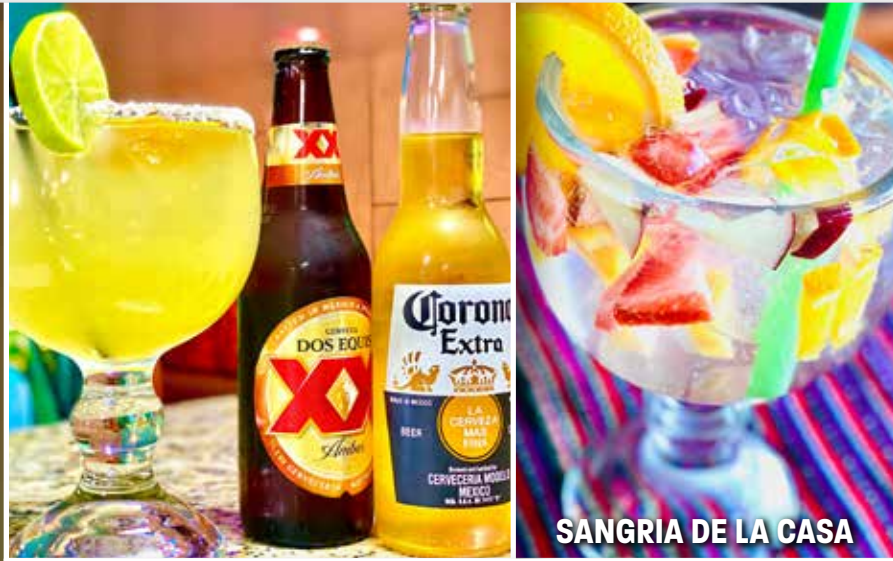
SANGRIA DE LA CASA