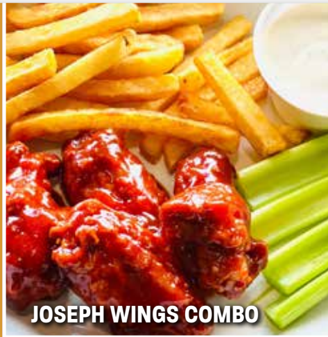
JOSEPH WINGS COMBO