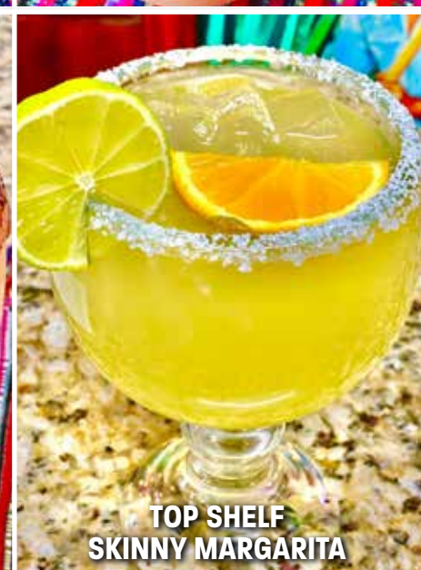
TOP SHELF SKINNY MARGARITA